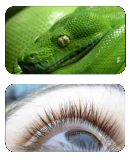
"But of the tree of the knowledge of good and evil, thou shalt not eat of it: for in the day that thou eatest thereof thou shalt surely die." (Gen. 2:17)