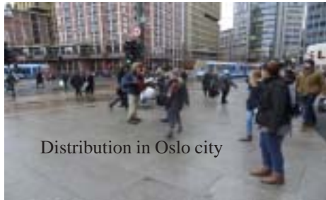
Distribution in Oslo city

Happy New Year for 2023, and thank you for all your wonderful support in 2022 from the two of us,