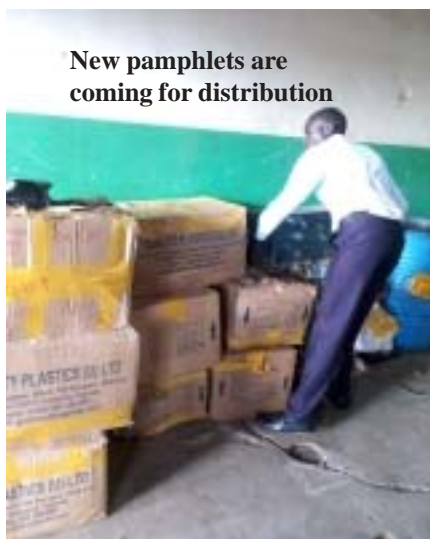
New pamphlets are coming for distribution

I am so thankful they have finally arrived, and they look amazing. The