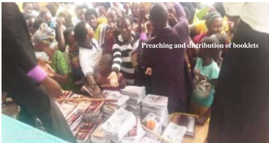
Preaching and distribution of booklets

I thank you for the educative message you shared with us on YouTube; may the Lord continue using you.